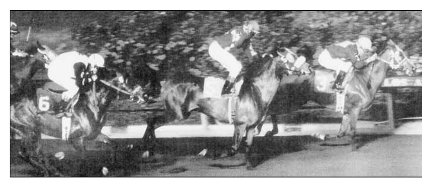
Wiezela, an Arabian raised and trained in Crittenden County, leads the field in a race back in the late 1990s.

In the middle of the beautiful scenery is an elegant two-story house that has a window in almost every nook and cranny, allowing