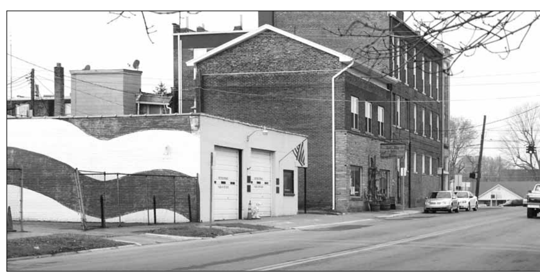
The south side of East Bellville Street is targeted for renovation through the Renaissance on Main Street Grant Fund. The work will be done this summer or fall.