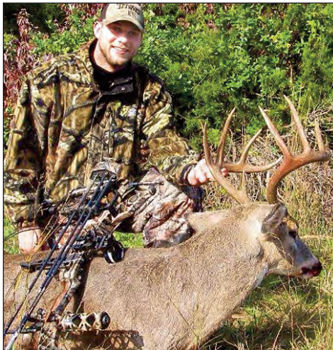
Former Tennessee Titans quarterback Jake Locker shows off a buck he took in this area last season.