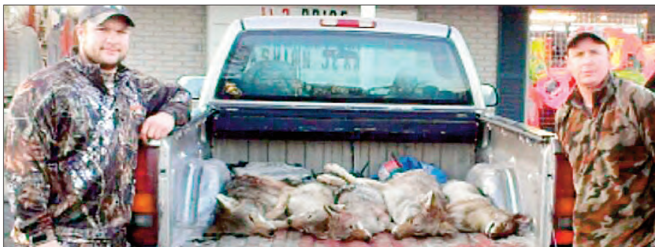
Beau Beckner and James Reece won their second straight coyote contest title late last winter.

"It's a good thing we got them when we did because the wind picked up Saturday morning and we didn't do any good after that," Reece added.