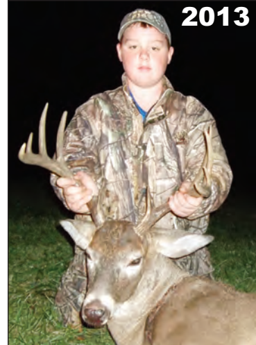
2013 "Dad said, 'A buck just chased a doe out of the woods,'" he recalled.