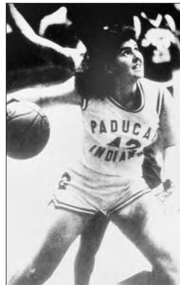
At Paducah Community College she earned the team's Sixth Man Award as a freshman.