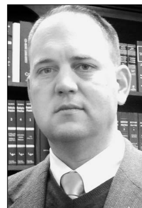
FRAZER 1,321 votes 39%

that means being open on Saturday or one night a week that's what we'll do."