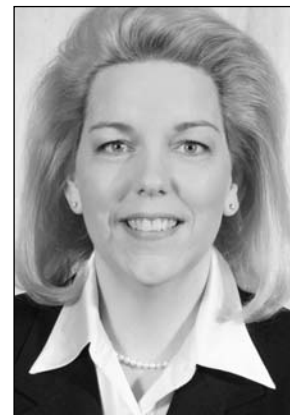
JOHNSON 2,053 votes 61%

"I've always said it should be accessible, and if